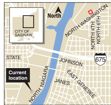
■ Rifkin Steel & Aluminum Co. relocation site

Brownfield Authority leaders will loan the money to the County Economic Development Corp. for cleanup, which will strive to meet a 90 percent